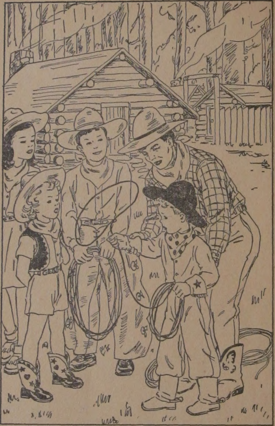
The cowboy taught the Bobbsey twins how to twirl a lasso.